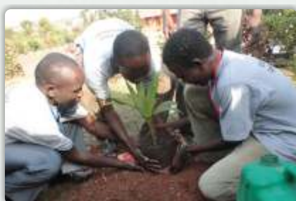
Delegates from Sudan planting a tree

Participants also engaged in an open discussion exploring the theme, 'Is the best of peace or the worst of conflict coming to Africa?' They looked at the hope of Africa as a peaceful continent in the future and challenges towards attaining that culture of peace and stability. Afterwards, each country had an