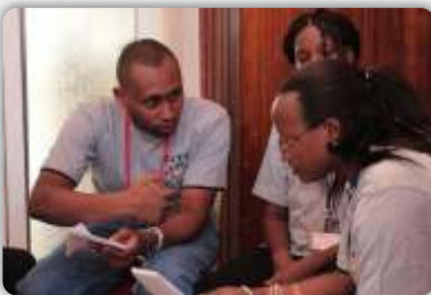
Delegates in a discussion group

The conference gave way to a safe space for sharing and bonding through the creation of smaller family groups. Reflections gave a chance for delegates to inwardly audit their role as peace ambassadors through the four absolute values of purity, honesty, unselfishness, and love that are upheld in lofC. During the leading the way sessions, participants got to listen from stories of change shared by young people as a form of inspiration.