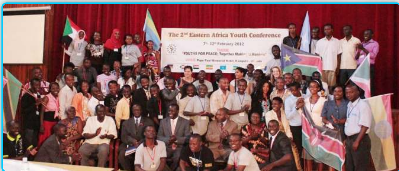
Delegates at the second EAYC after the opening ceremony.

After the inaugural forum held in Kenya in 2011, it was a great pleasure to host the 2 nd Eastern Africa Youth Conference (EAYC) in Kampala, Uganda under the theme 'Youths for Peace: Together making it happen!' Over 60 delegates from the region and beyond made it to be part of this venture.