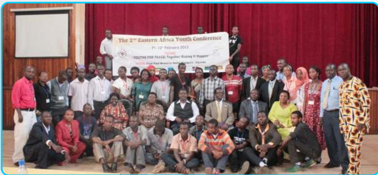
Delegates pause for a group photo after the closing ceremony