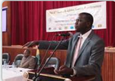
Hon. Dan Kidega, the chief guest speaking at the opening Ceremony

During the 2 nd EAYC held in February 2012 in Kampala Uganda, the delegates explored practical ways to respond to conflict and violence in the region. It featured speakers with a great wealth of knowledge and experience in peace initiatives from Kenya, South Sudan and Uganda. During the week, participants brainstormed and shared on issues including the Role of Civil Society as well as Accountability and Values as part of good governance, Peace and Security challenges in Africa, Role of Non-violence in conflict transformation and Youths as a pillar to building sustainable peace.