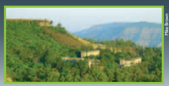
ASIA PLATEAU CONFERENCE CENTRE www.in.iofc.org PANCHGANI, INDIA

Initiatives of Change International receives occasional grants for specific projects from governments and private foundations, and is supported by contributions from individuals and its 21-member national societies. Fresh funds would enable us to expand our capacity, to satisfy the growing demand for our trust-building work. Contributions are usually most tax-efficient through the national associations of lofC. Contributions and funding enquiries for international operations can be directed through the Treasurer: treasurer@iofc.org For online payments see: www.iofc.org/support