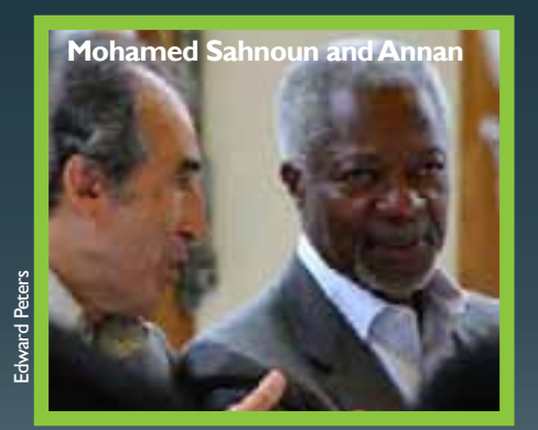
KOFI ANNAN SPEAKS AT IofC CONFERENCE IN CAUX