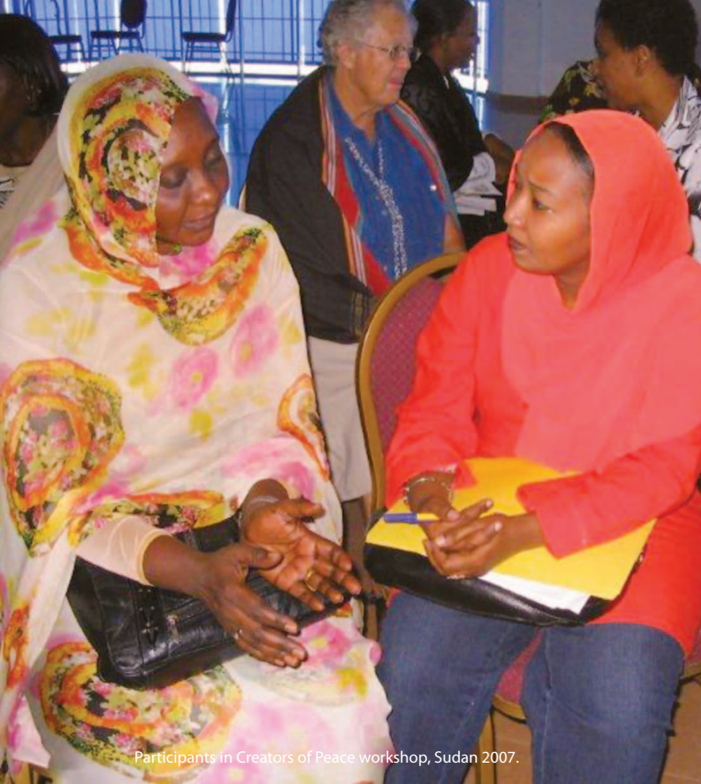
Participants in Creators of Peace workshop, Sudan 2007.