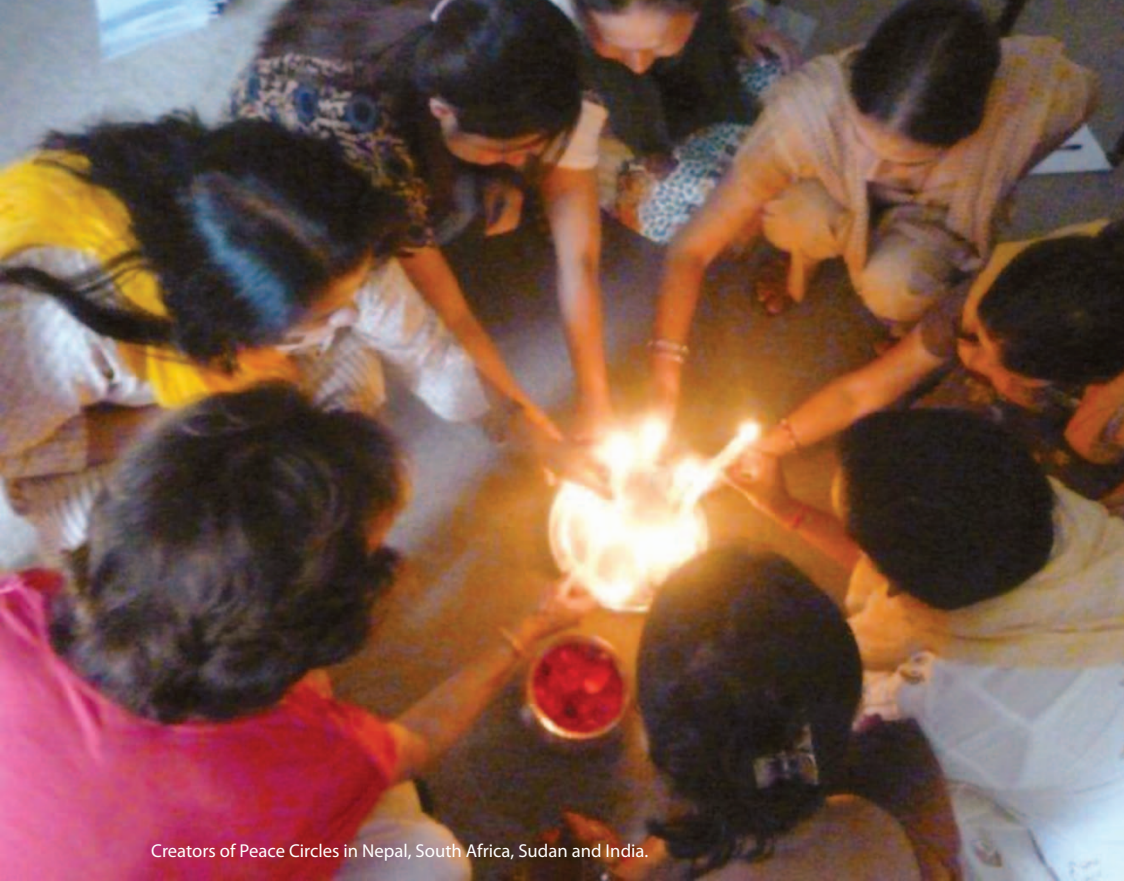
Creators of Peace Circles in Nepal, South Africa, Sudan and India.