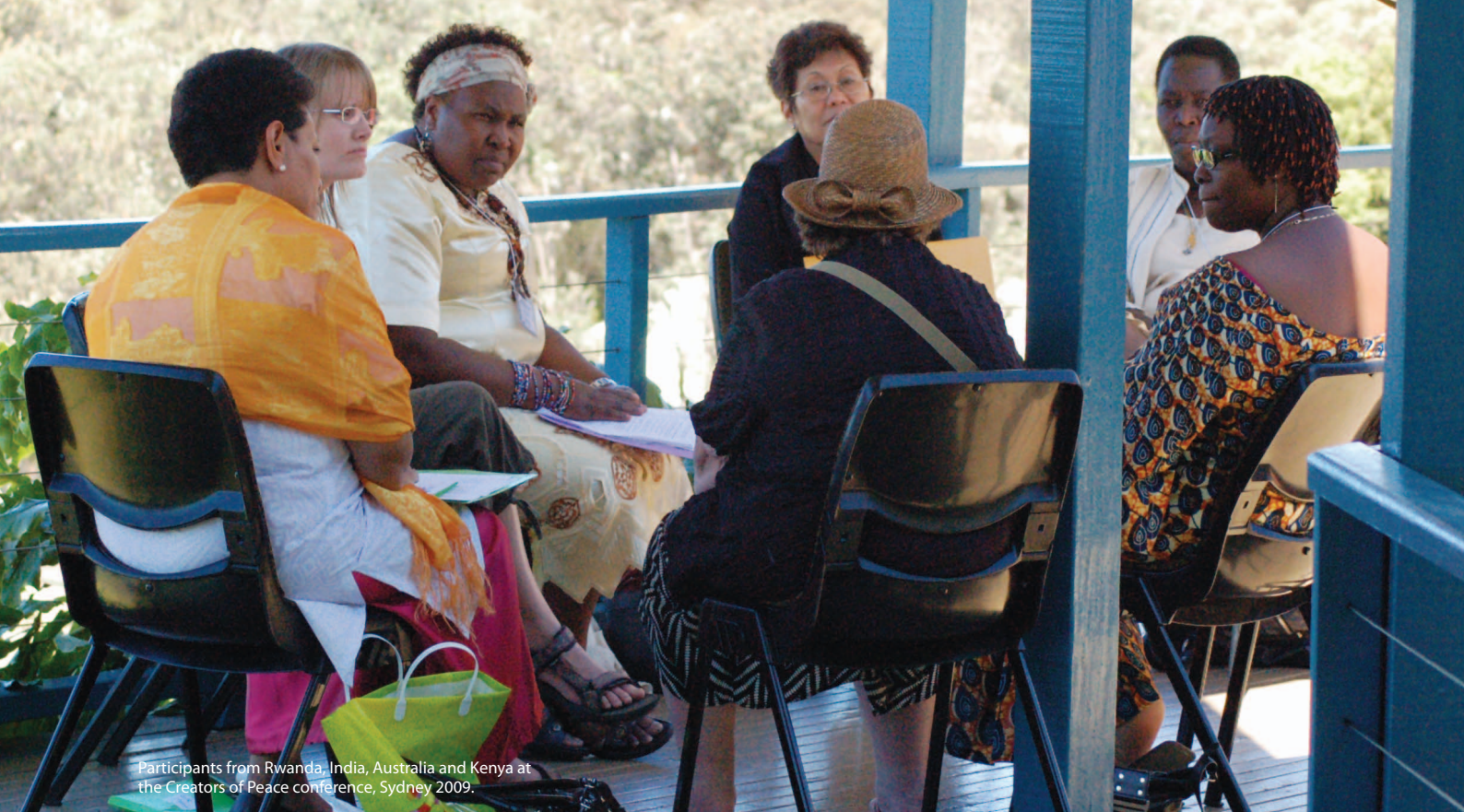
Participants from Rwanda, India, Australia and Kenya at the Creators of Peace conference, Sydney 2009.

In 2004, the first Creators of Peace Circle was launched in Adelaide and was quickly taken up in other Australian cities and then in other countries.