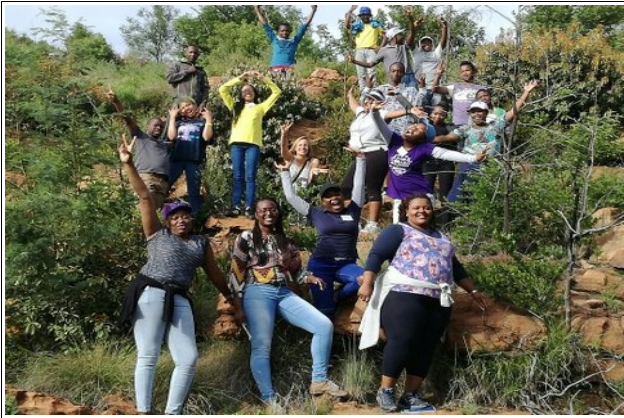
Participants and mentors

front of the group. Each day the team saw a change as he began to share a little more and on the final day, with self-assurance, he gave a motivating speech to his peers! It was a delightful moment for all.