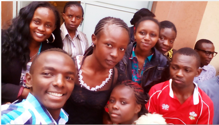
A selfie moment with participants

In the month of July and August 2015 we had two (8am- 9am) sessions with young Catholic students of St. Theresa Kalimoni Juja where we discussed role of youth in the church and society. The need for change in our way of communication, respect for one another and commitment in church activities could be best addressed through IofC ideas, which helped to challenge one's disciplines and principles.