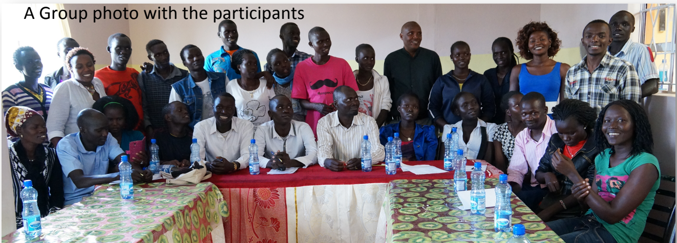
A Group photo with the participants

Coming from a war torn state, the South Sudanese youth are more than willing to take part in peace and reconciliation work –where they can hopefully facilitate forums that will