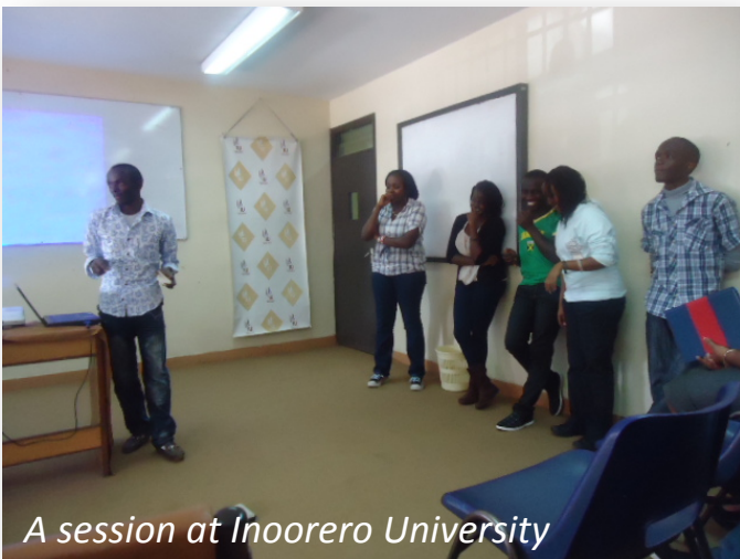
A session at Inoorero University

Nairobi and Kiambu Counties had various activities mostly in tertiary colleges. In 2014 we had collaboration with Alpha institute of Accounting (Juja) where we held Kenya I Care meetings at least once a month, Jomo Kenyatta University, Inoorero University, Mt. Kenya