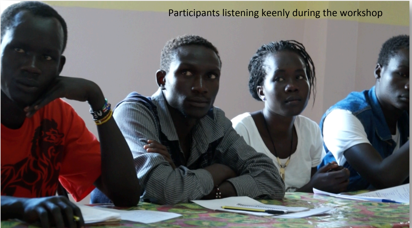
Participants listening keenly during the workshop

In 2015 we continued with our activities in Nairobi Institute of Business, Alpha Institute and St. Theresa Juja young Catholics. We also had 'Effective Living' workshops with young South Sudanese living in Nairobi and Kiambu Counties in the months of April and May.