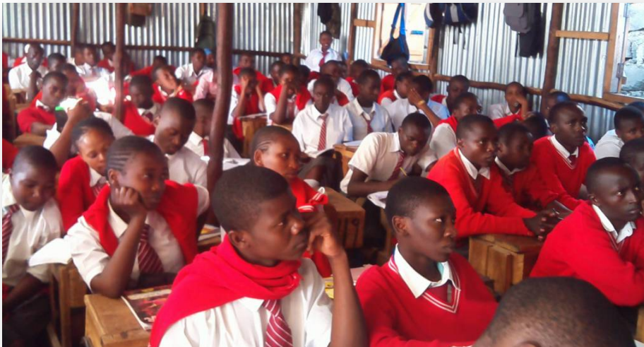
Participants listening keenly during a session

Kenya I Care program also took part in Nakuru areas. This program ensures that the youth engage their fellow youth in responsible and integral dialogues. We all believe that we should be a book that, the world (the community around us) should read from. And therefore the question remains, what kind of a book is our life? But we also again say that whatever change we need to see around us, we should be part of its initializing, which is now the core and foundation of KIC Kenya. We believe it's our duty to help reshape the environment around us; socially, physically, emotionally and in every prospect.